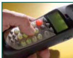
control access with a simple push of a button on your touch-tone telephone