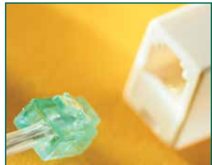
no central office necessary just plug a touch-tone telephone into the apartment phone jack