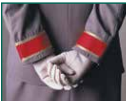
doorman telephone inputs for high-rise apartment buildings