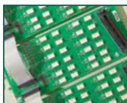
capacity easily expanded with additional line interface boards