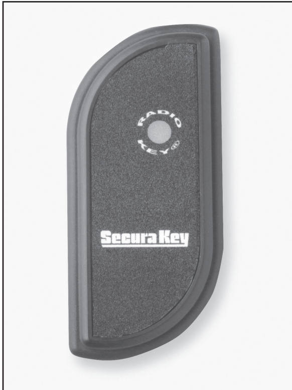
RADIO KEY® RK-WM - ACTUAL SIZE

Radio Key® RK-WM Proximity Reader is designed to integrate into any system requiring a Wiegand output. The reader will read Secura Key proximity cards or key tags and transmit the data in virtually any Wiegand Format up to 40 bits.